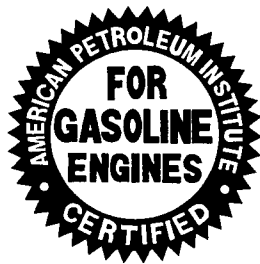
API CERTIFICATION MARK